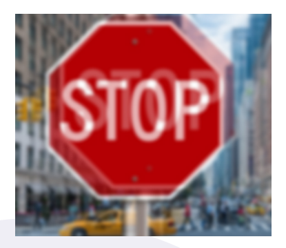
Double vision can be a symptom of Thyroid Eye Disease.

In more advanced thyroid eye disease, there may also be: