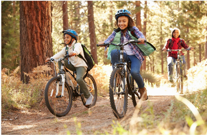
Personal Health Literacy