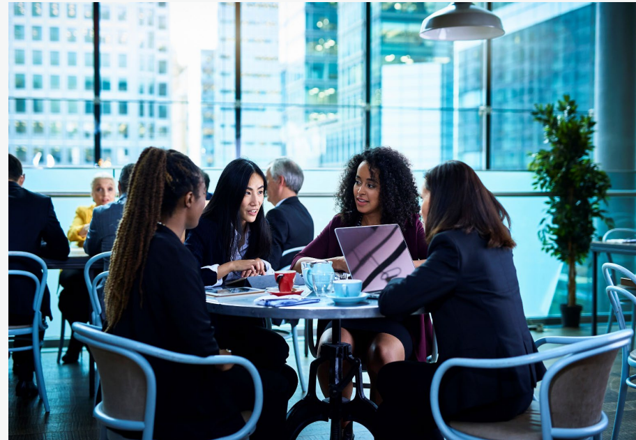
Organizational Health Literacy